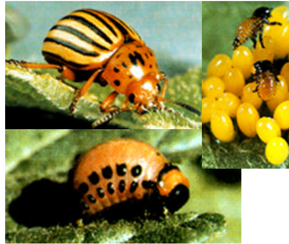
Adult, mature larva, and eggs and 1 st instar larvae

Some insecticides used to control other potato pests feeding on foliage also may control Colorado potato beetle. However, the Colorado potato beetle has become resistant to most registered insecticides in the