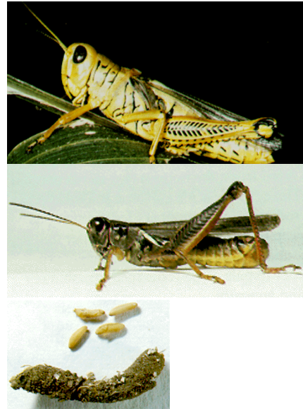
Adult grasshoppers and eggs from egg pod

Adults of the migratory grasshopper are about 25 to 30 mm long and light brown with dark markings. Adults of the two-striped grasshopper are about 36 mm long, greenish-yellow or olive, with two light yellow stripes running from the back of the head to the wing tips. The yellow on the hind femur has a conspicuous black dorsal band. Adults of the redlegged grasshopper are about 20 to 25 mm long with a bright yellow ventral surface and the remainder of the body reddish-brown. This species has a red hind tibia. Adults of the clearwinged grasshopper are about 25 mm long, yellow or brown and marked with large, dark brown spots. Adults of the bigheaded grasshopper are about 25 mm long with a grayish-brown body and a deep blue hind tibia. The head appears large in relation to the body.