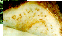
Potato leafroll infection and net necrosis in tuber