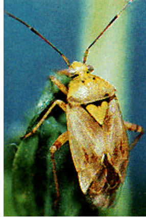
Lygus bug adult

It is important to check fields for the presence of lygus nymphs in May and early June to determine whether or not insecticide treatment is necessary. Treatment is justified when adults and nymphs are present during the prebloom period. If an application is necessary, apply on warm days in late May. Be sure no blooming weeds are present in the field to avoid killing bees. A second application may be necessary during bloom (prior to Aug. 15) usually when adults and nymphs average 2 to 3 per sweep but before nymphs reach the third instar.