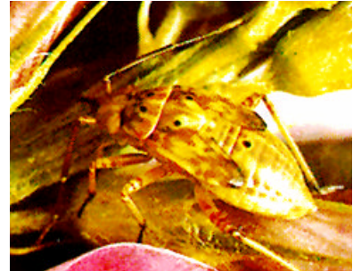
Late instar nymph