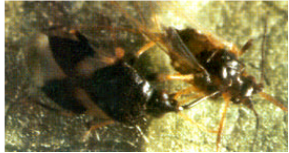
Minute pirate bug adult

Adults and nymphs are very active predators and may be found on all aerial parts of plants. Active stages feed by sucking the body fluids from aphids, spider mites, thrips, insect eggs, and immature stages of many small insects. They are particularly effective predators of thrips and spider mites. Adults and immature stages may consume more than 30 spider mites per day.