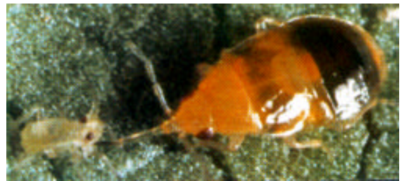
Minute pirate bug nymph